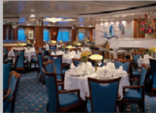
Crossings Main Dining Room

Enjoy Norwegian's Sky award-winning cuisine in this large dining room with impressive views of the sea and sky