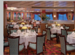
Palace Main Dining Room

Enjoy Norwegian's Sky award-winning cuisine in this large dining room with impressive views of the sea and sky