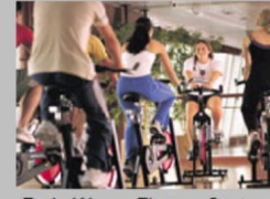
Body Waves Fitness Center